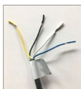
adjustable power connection